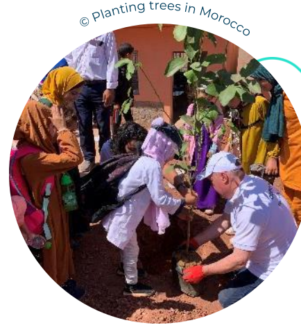
© Planting trees in Morocco