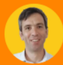
J. Lemarchand King Baudouin Foundation